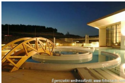
Egerszalóki wellnessfürdő